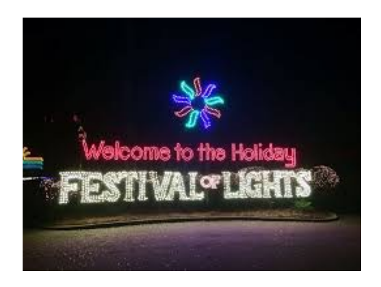
The first of many light displays at the Holiday Festival of Lights in Charleston, SC.

November is the time for giving thanks, and for being with friends and family. At Project Rex, we are very thankful to be with one another. It shows that we have potential and that we can do anything we put our minds to. There are two events in November: the Holiday Festival of Lights and the Turkey Day Run. Both of these events are amazing and fun.